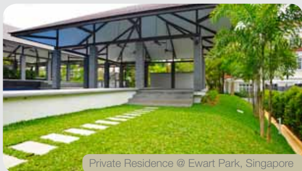
Private Residence @ Ewart Park, Singapore