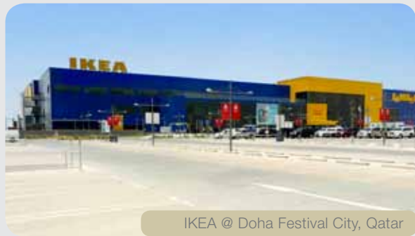
IKEA @ Doha Festival City, Qatar