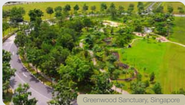
Greenwood Sanctuary, Singapore